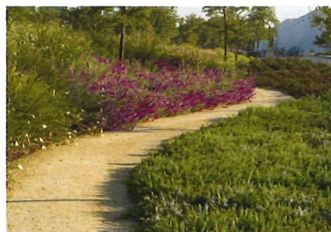
Four miles of trails will preserve open space while giving residents a safe place to walk.

Forty-two acres of open land will be maintained as public space for the residents. Almost four miles of trails will be created throughout the former fairways to link the new neighborhoods. These trails will feature natural permeable surface material and low glare lighting for a safe pedestrian-friendly walkway.