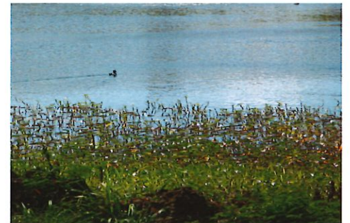
Generous areas of open space will be integrated throughout the new community, enhancing the natural setting.

The current water feature near Paseo Grande will be improved to create a small lake to enhance the natural setting and attract migrating birds.